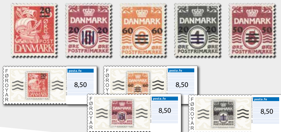
The overprinted stamps from 1940-41. The Franking Labels issued 01.10.2015.